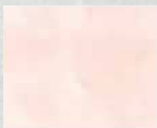
504 Clam Shell