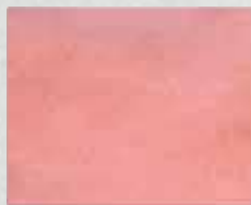
402 Apple Blossom