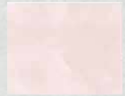
304 Pink Swan