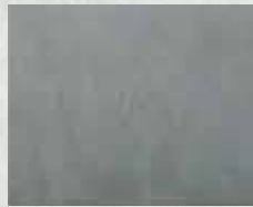
109 Dark Grey