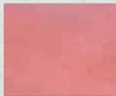
403 Quarry Red