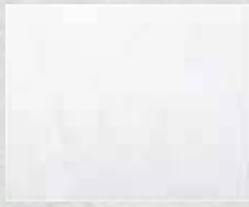
103 Snow White