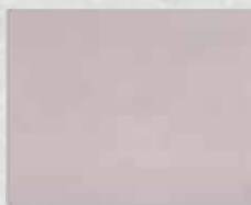
601 Dull Lavender