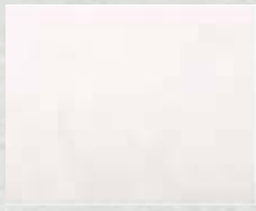
101 Oyster White