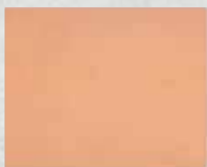
503 Brownish Orange