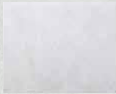
108 Light Grey