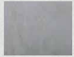
106 Porcelain Grey