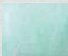
702 Lemon Grass