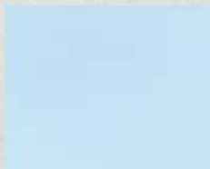
801 Sky Blue