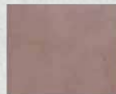
603 Burly Wood