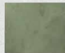
705 Olive Haze