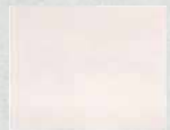
604 Pastel Grey