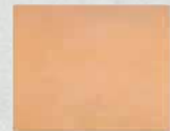
502 Sand Brown