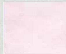
404 Baby Pink