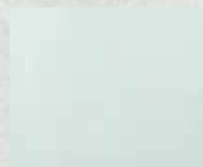
704 Grey Olive