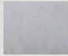
105 Stone Grey