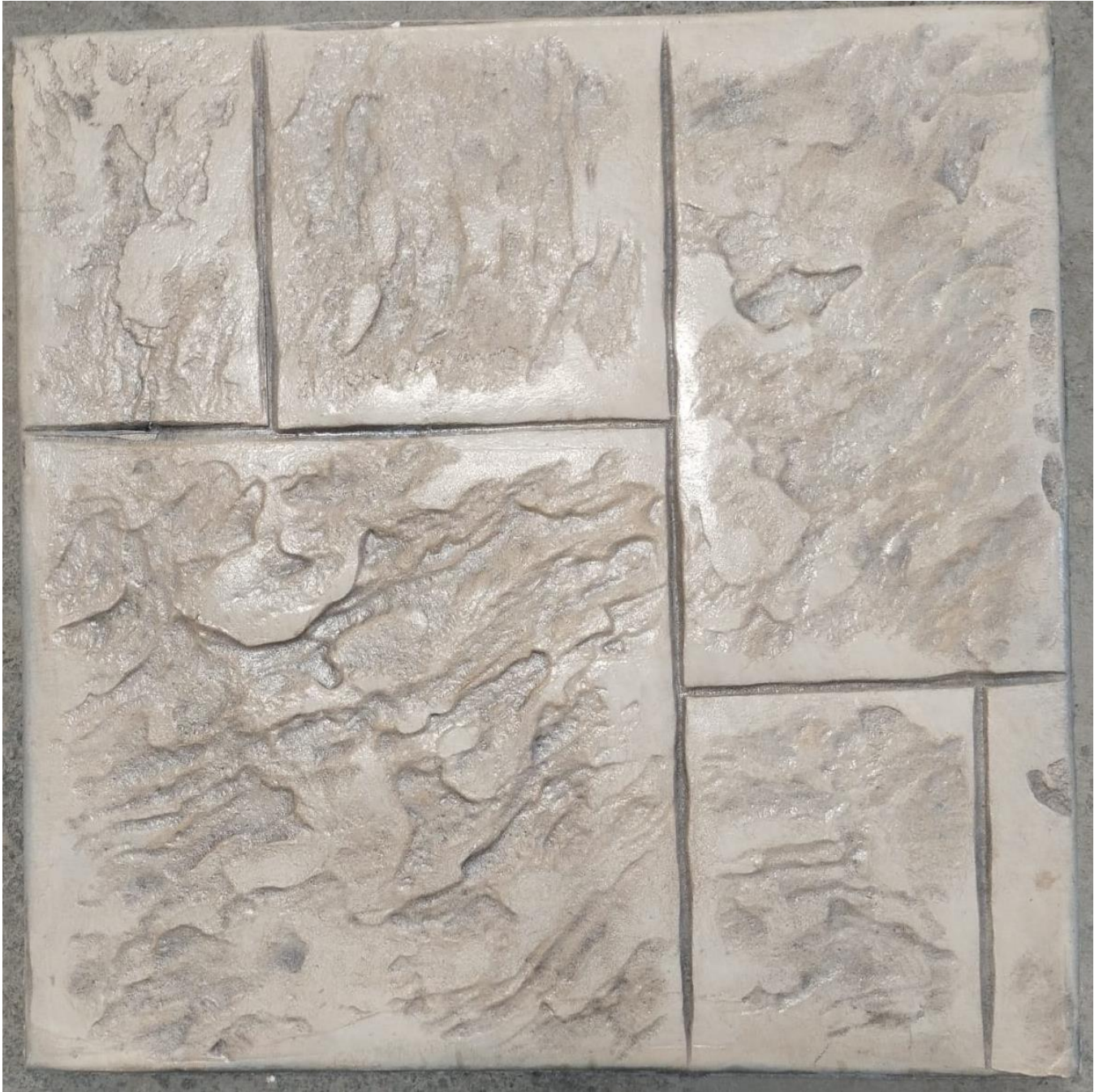
REGAL ASHLER C305R100