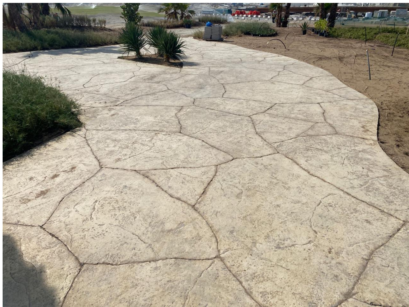
ROUGH STONE C310R325 Artificial Crack Designs