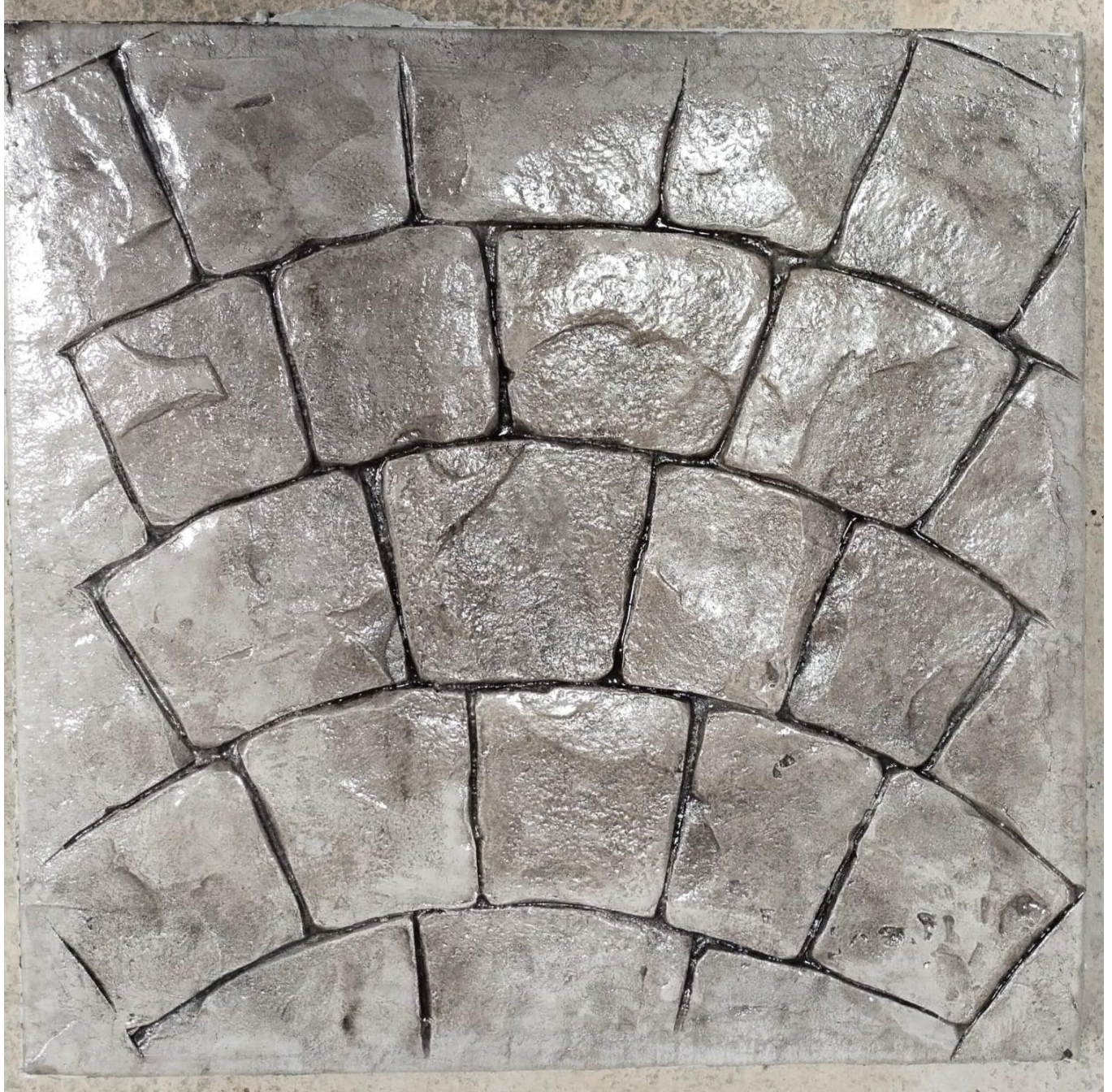
EUROPEAN FAN C200R100