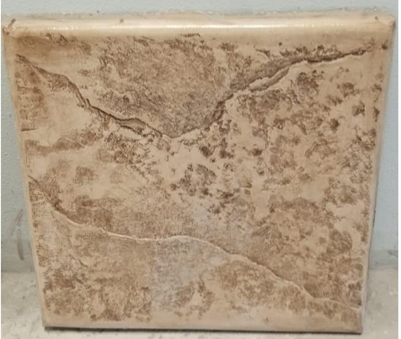
ROUGH STONE C305R310