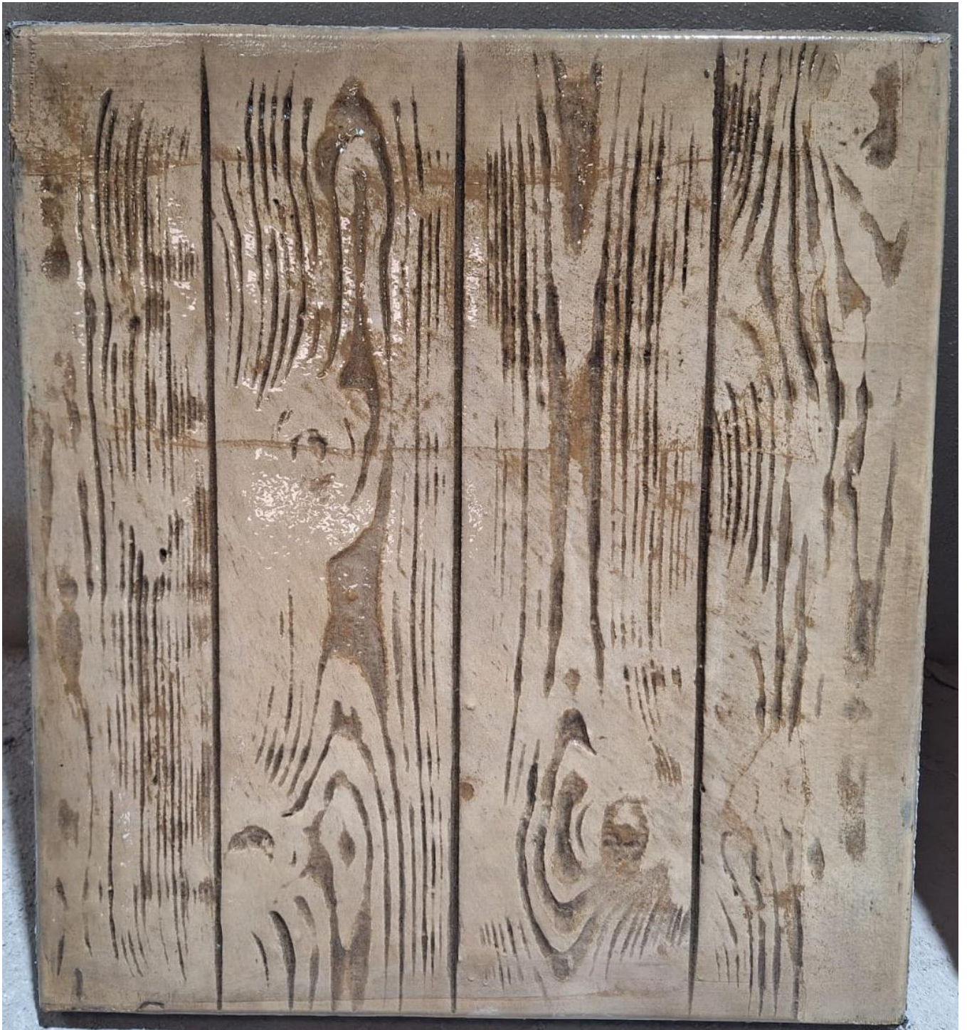
CLASSIC WOOD C305R100