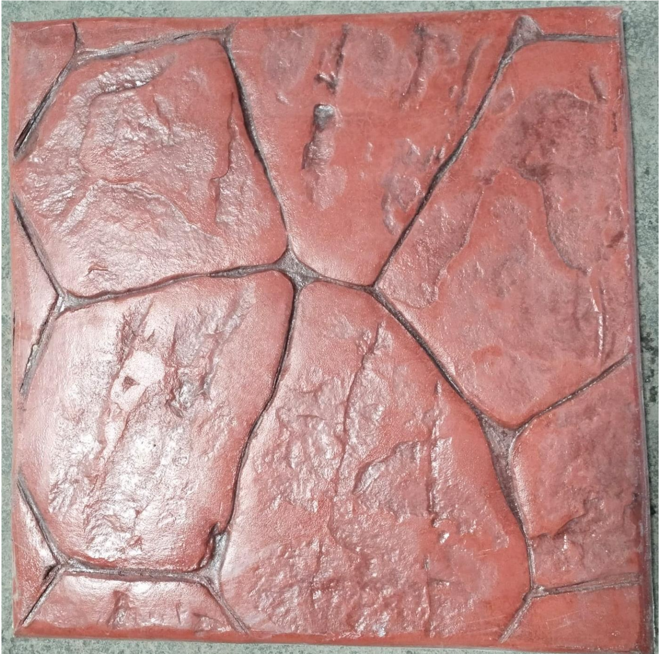
RANDOM STONE C500R100