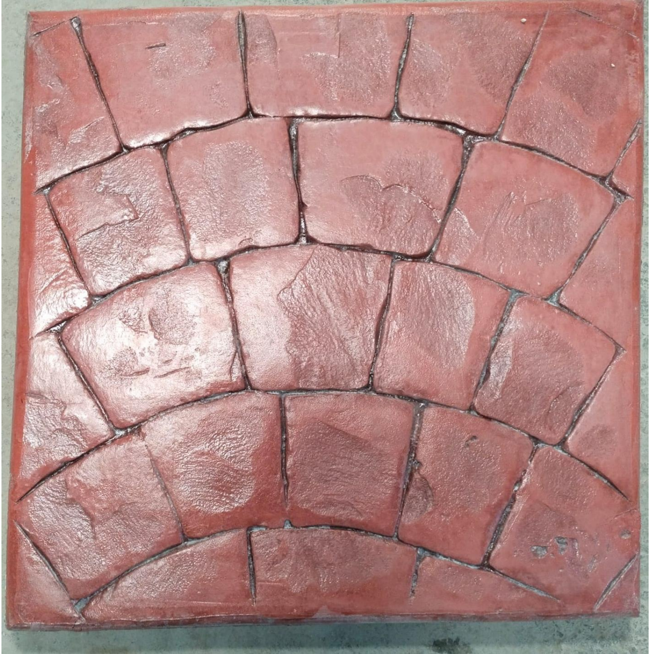
EUROPEAN FAN C500R100