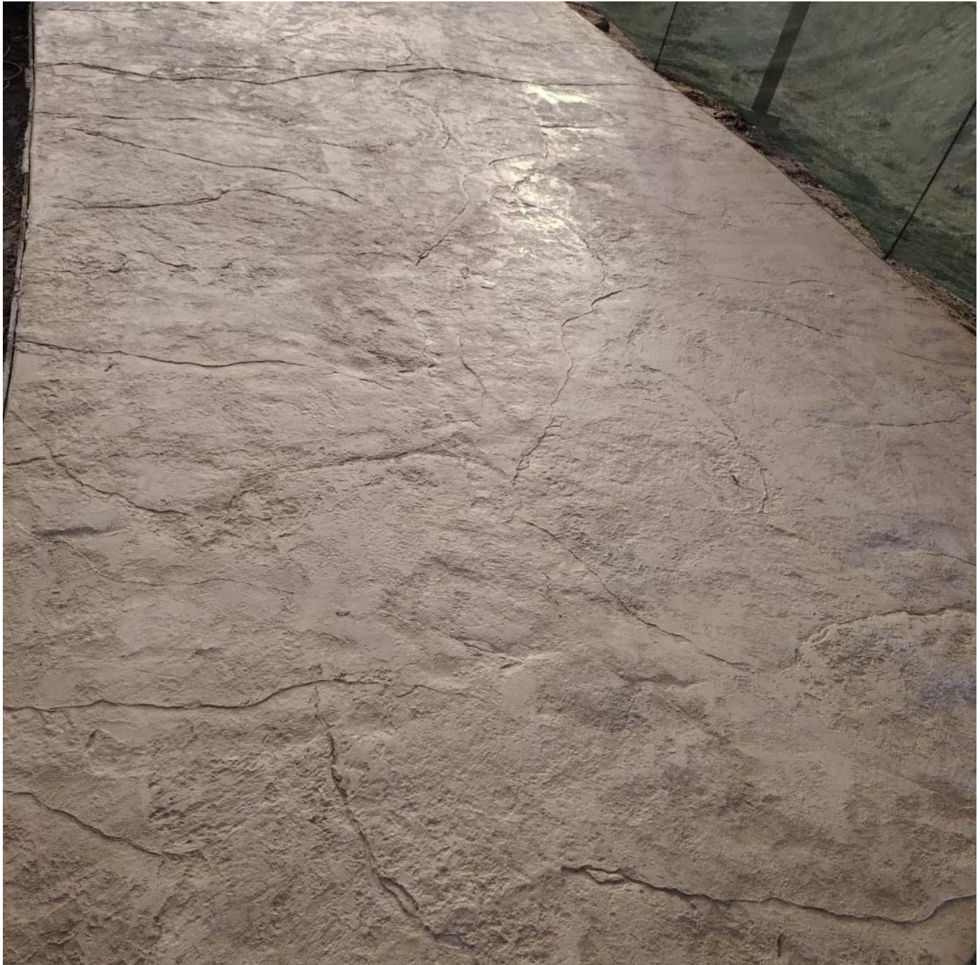
ROUGH STONE C305R310