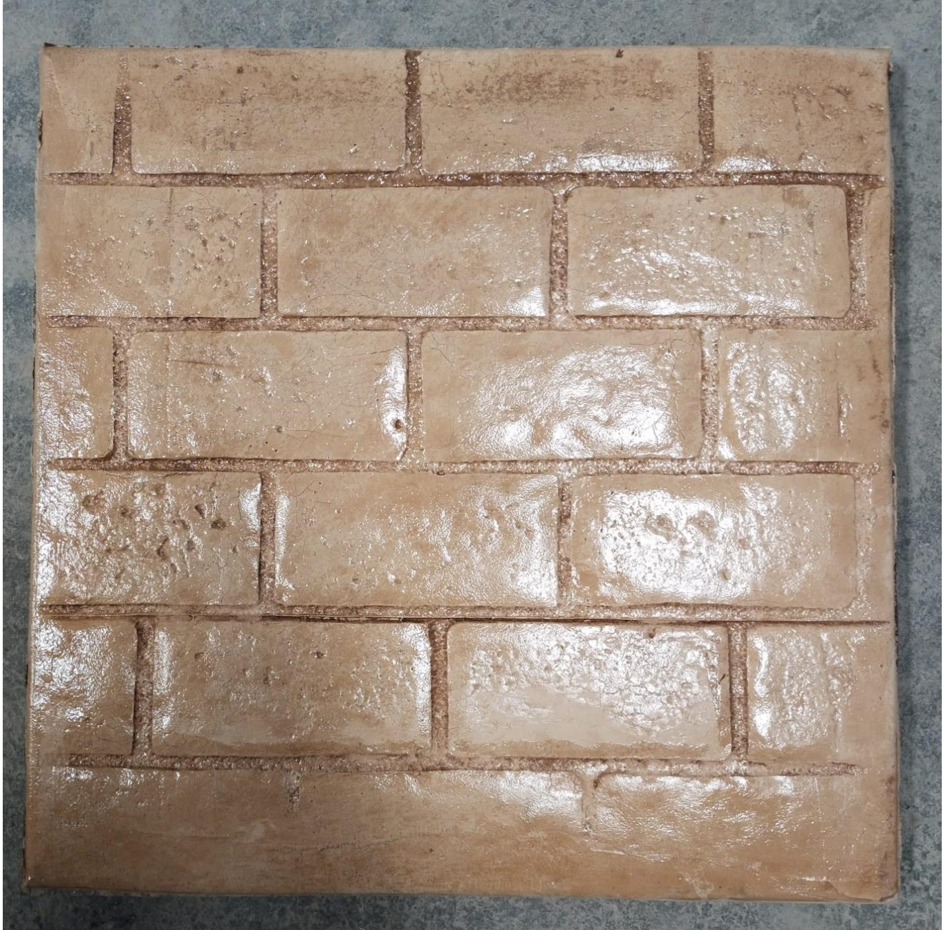
RUNNING BOND BRICK C310R325