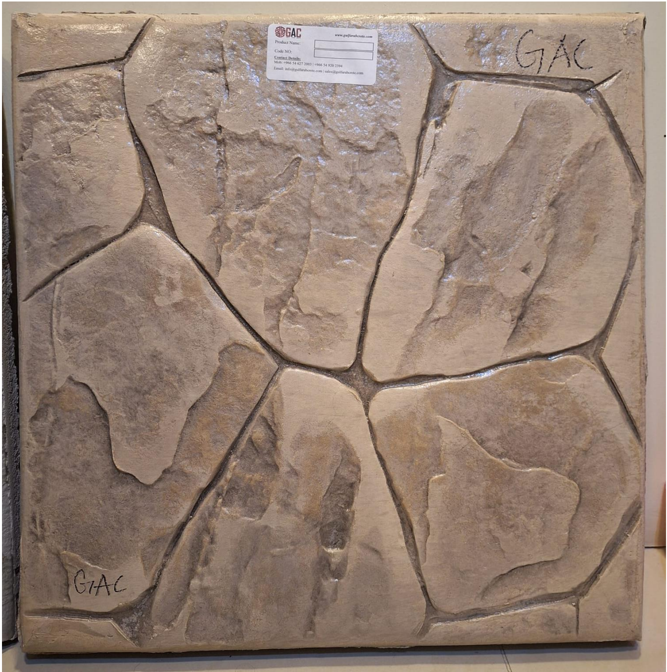
RANDOM STONE C305R100