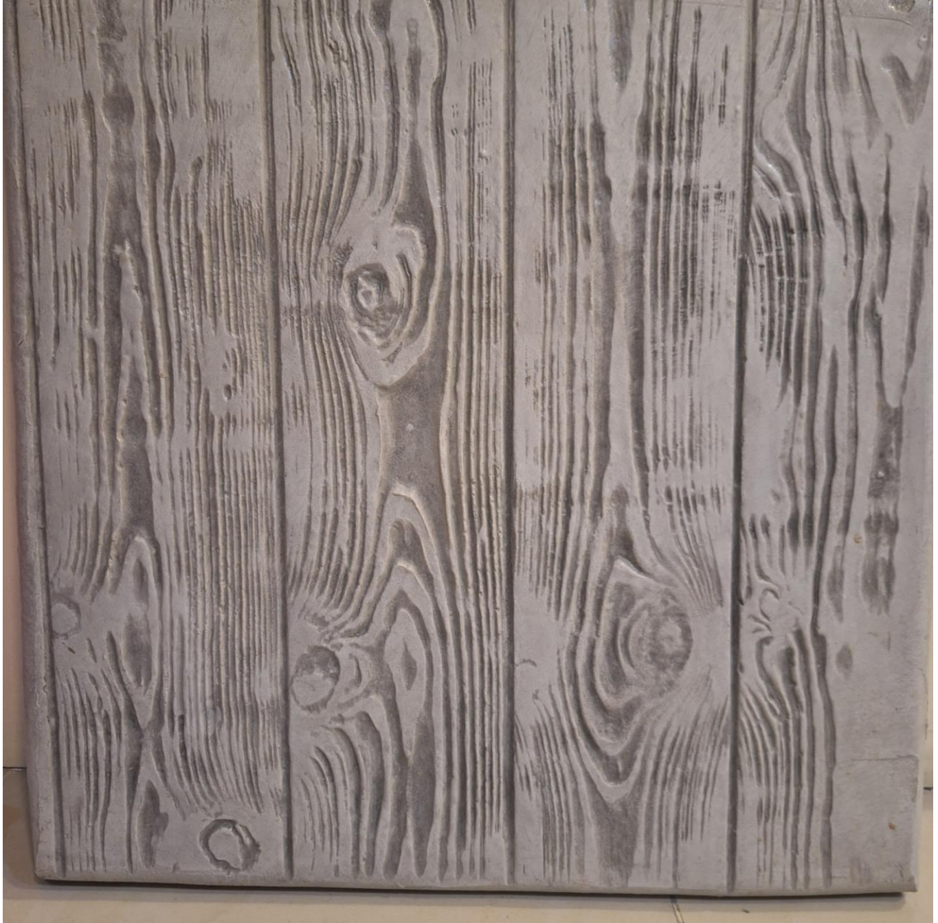
CLASSIC WOOD C600R100