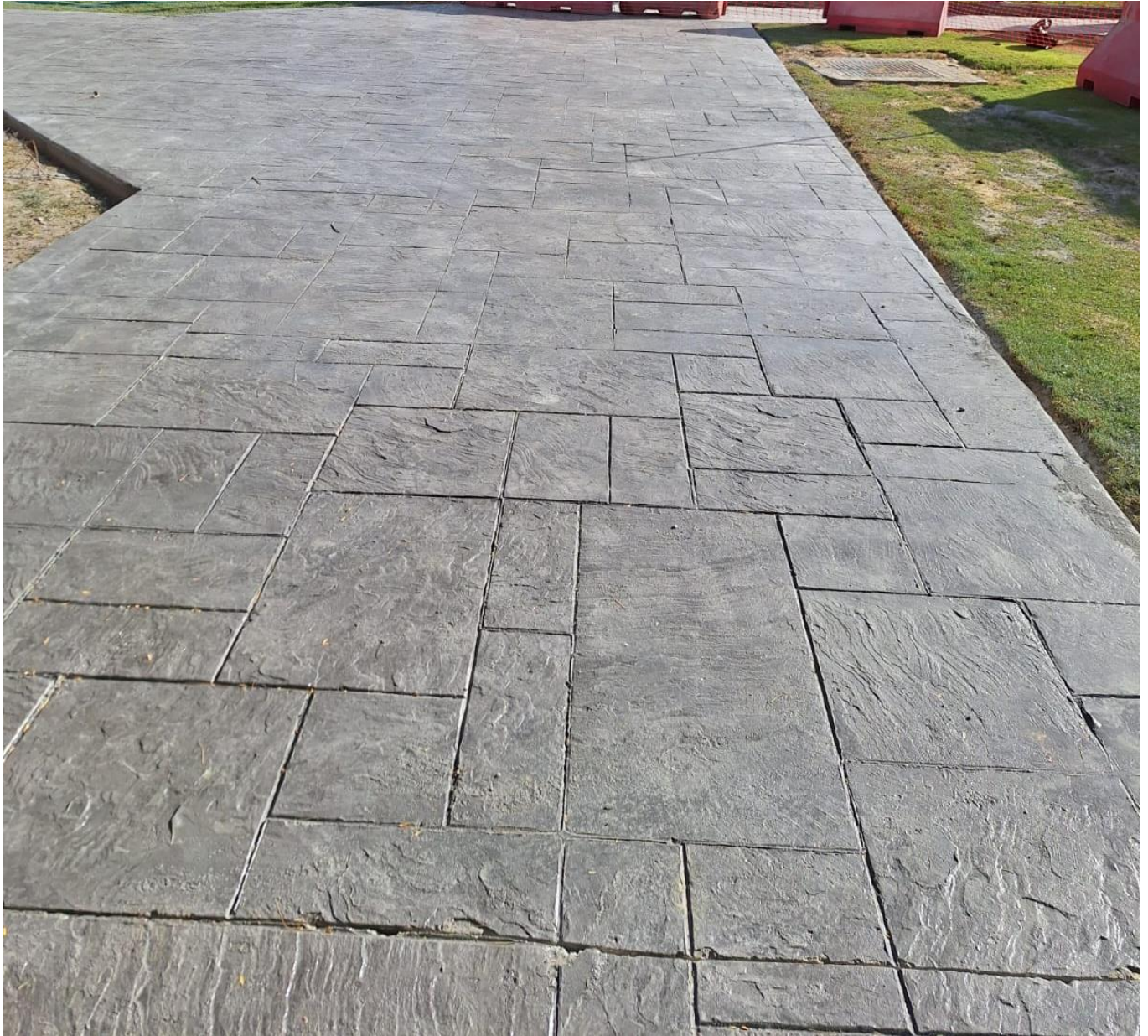
REGAL ASHLER C200R100